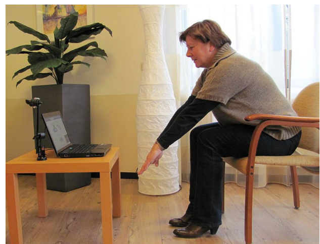
Fig. 1 Remote exercise program for physical and cognitive training

In CLEAR, patients with cognitive problems were enabled to train independently either at the rehabilitation institute or at home and are monitored by a health professional for about 2–3 months. Stroke patients started training at the hospital and continued at home, and at least twice